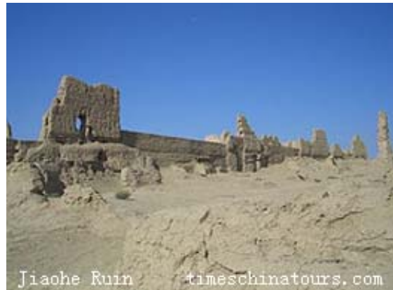
Jiaohe Ruin timeschinatours.com

Day 07 Turpan Breakfast Visit the Jiaohe Ruins Visit the Karez Well Lunch Visit the Sugong Pagoda Overnight at hotel