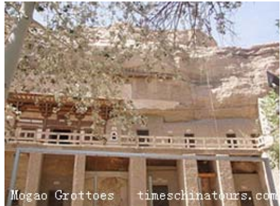
Mogao Grottoes