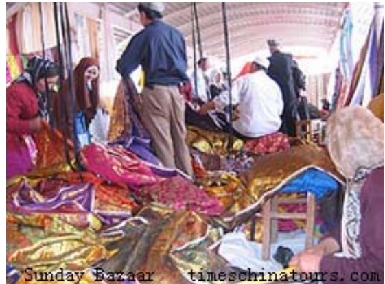
Sunday Bazaar timeschinatours.com

Day 06 Kashgar/Urumqi/Turpan Breakfast Visit the Etigar Mosque Visit the Old Street Visit the Abakh Khoja Tomb Lunch Transfer to airport and flight to Urumqi and departure to Turpan by bus Overnight at hotel