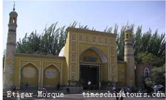
Etigar Mosque timeschinatours.com

Breakfast Transfer to airport and flight to Kashgar Lunch Visit the Sunday Bazaar Overnight at hotel