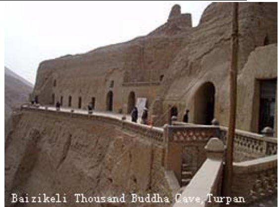
Baiyazikeli Thousand Buddha Cave, Turpan