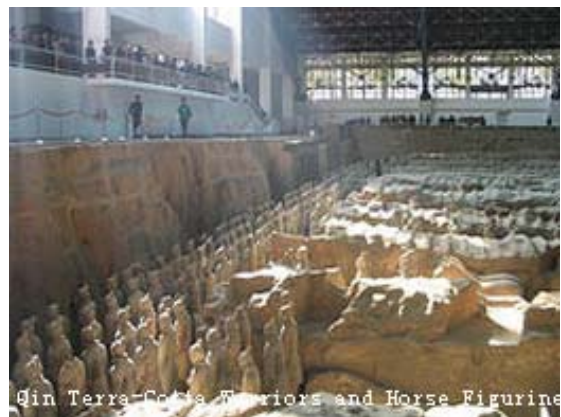
Qin Terra-Cotta Warriors and Horse Figurines