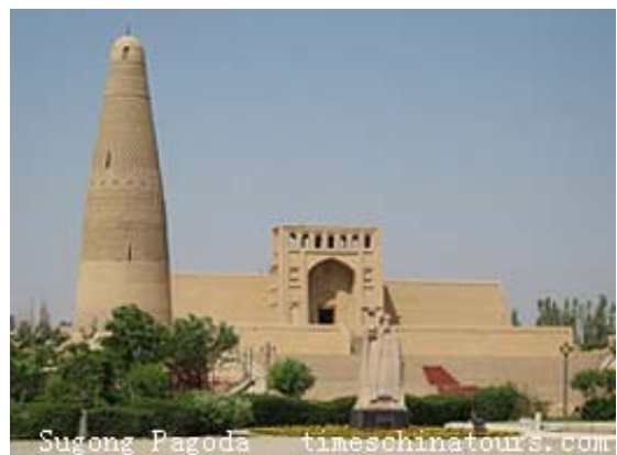
Sugong Pagoda timeschinatours.com

Day 08 Turpan/Dunhuang Breakfast Visit the Gaochang Ruins Visit the Baizikeli Thousand Buddha Cave Lunch Visit the Flaming Hill Dinner Transfer to railway station and departure to Dunhuang by train Overnight on the train