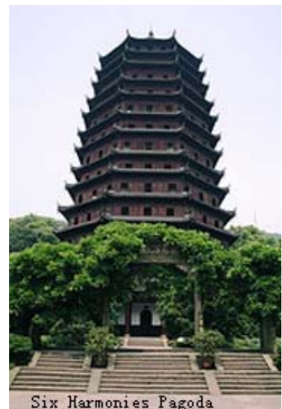
Six Harmonies Pagoda