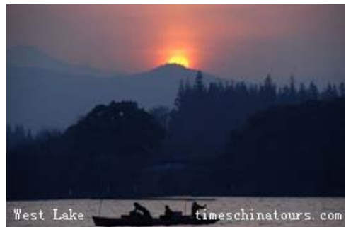
West Lake timeschinatours.com