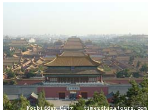
Forbidden City