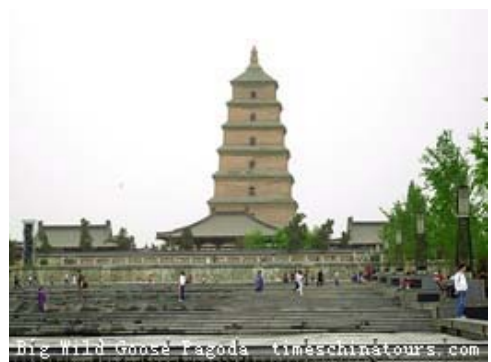
Big Wild Goose Pagoda timeschinatours.com