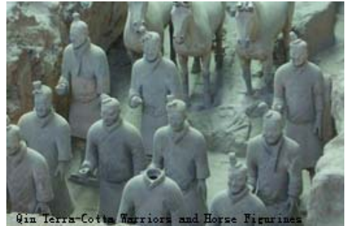
Qin Terra-Cotta Warriors and Horse Figurines