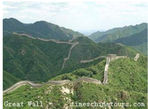
Great Wall timeschinatours.com