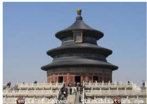
Temple of Heaven