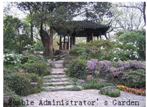
Humble Administrator's Garden