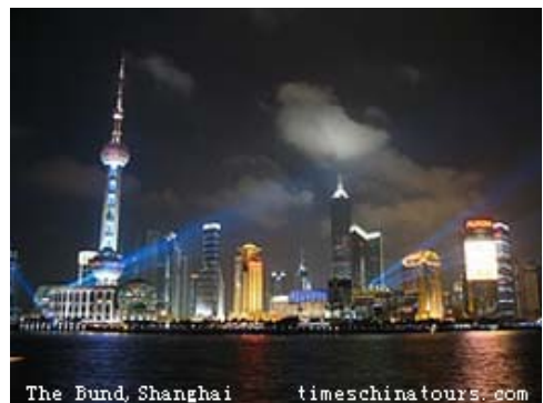
The Bund, Shanghai timeschinatours.com