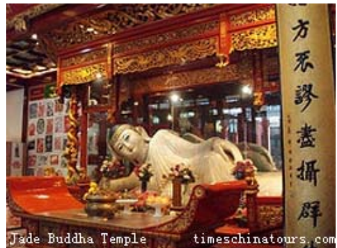
Jade Buddha Temple

The price included: Downtown 4 star hotel Meals, it is already show on the itinerary Tickets Air-conditioned bus or car Local tour guide Domestic flights Beijing/Shanghai The price does not include: International flights Insurance Tips for tour guides and drivers