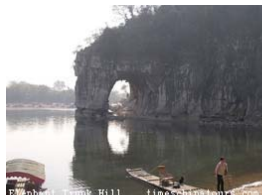
Elephant Trunk Hill