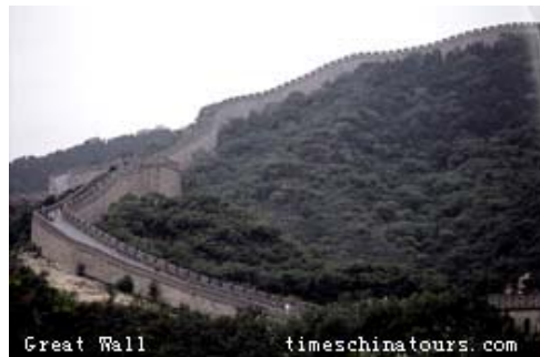
Great Wall timeschinatours.com