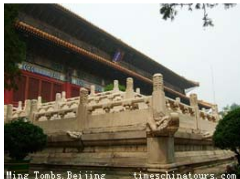
Ming Tombs, Beijing