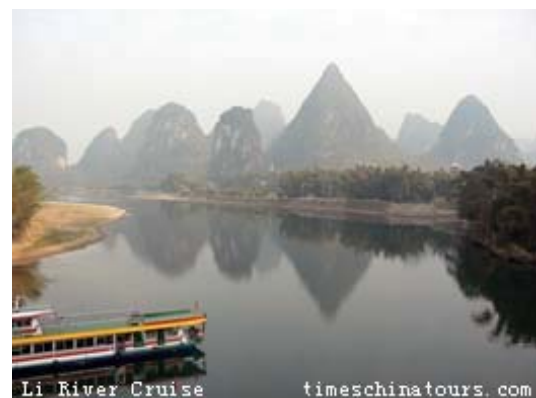
Li River Cruise