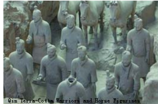
Qin Terra-Cotta Warriors and Horse Figurines