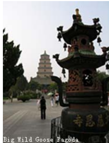
Big Wild Goose Pagoda