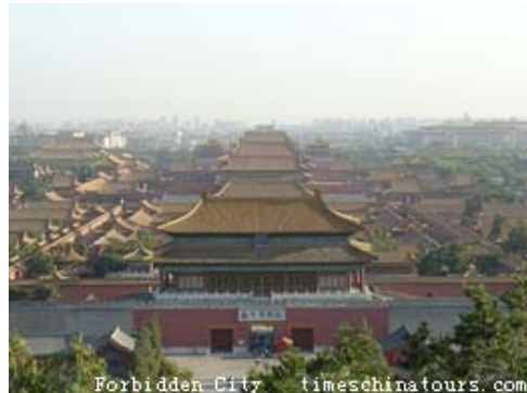
Forbidden City timeschinatours.com