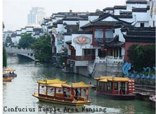
Confucius Temple Area, Nanjing

Visit the Dr. Sun Yat-sen's Mausoleum Visit the Ming Xiaoling Mausoleum Lunch Visit the Confucius Temple Area Overnight at hotel