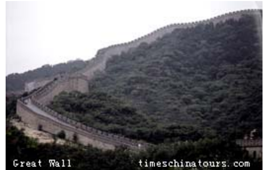
Great Wall timeschinatours.com