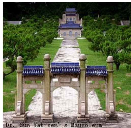
Dr. Sun Yat-sen's Mausoleum