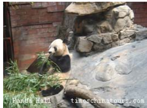
Panda Hall timeschinatours.com