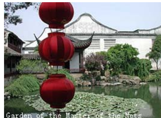
Garden of the Master of the Nets

Day 07 Suzhou/Zhouzhuang/Suzhou Breakfast Departure to Zhouzhuang by bus Enjoy NO.1 Water County of China Lunch Visit the Hall of Shen's residence Return to Suzhou by bus Transfer to hotel Overnight at hotel