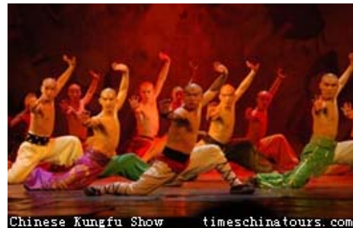
Chinese Kungfu Show timeschinatours.com